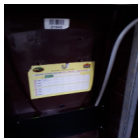
( http://vendingcare.in/vendingcare/Images/JobImages/72005_3.png )