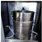
( http://vendingcare.in/vendingcare/Images/JobImages/72005_1.png )