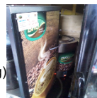
( http://vendingcare.in/vendingcare/Images/JobImages/72005_2.png )