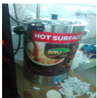
( http://vendingcare.in/vendingcare/Images/JobImages/69553_1.png )