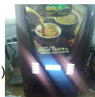
( http://vendingcare.in/vendingcare/Images/JobImages/69553_2.png )