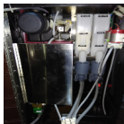
( http://vendingcare.in/vendingcare/Images/JobImages/98840_3.png )