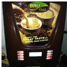
( http://vendingcare.in/vendingcare/Images/JobImages/98840_1.png )