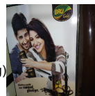
( http://vendingcare.in/vendingcare/Images/JobImages/98840_2.png )