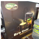
( http://vendingcare.in/vendingcare/Images/JobImages/98840_4.png )