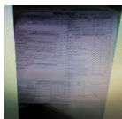
( http://vendingcare.in/vendingcare/Images/JobImages/99085_1.png )