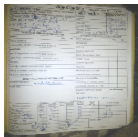
( http://vendingcare.in/vendingcare/Images/JobImages/96702_3.png )