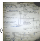
( http://vendingcare.in/vendingcare/Images/JobImages/96702_2.png )