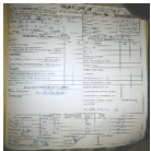
( http://vendingcare.in/vendingcare/Images/JobImages/96702_1.png )