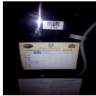
( http://vendingcare.in/vendingcare/Images/JobImages/82926_3.png )