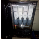
( http://vendingcare.in/vendingcare/Images/JobImages/82926_1.png )