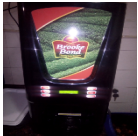
( http://vendingcare.in/vendingcare/Images/JobImages/82926_4.png )