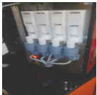
( http://vendingcare.in/vendingcare/Images/JobImages/75155_4.png )