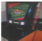
( http://vendingcare.in/vendingcare/Images/JobImages/75155_6.png )