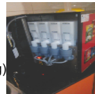
( http://vendingcare.in/vendingcare/Images/JobImages/75155_5.png )