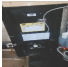
( http://vendingcare.in/vendingcare/Images/JobImages/75155_3.png )