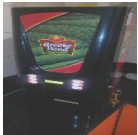
( http://vendingcare.in/vendingcare/Images/JobImages/75155_1.png )