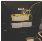
( http://vendingcare.in/vendingcare/Images/JobImages/75217_1.png )