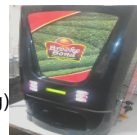
( http://vendingcare.in/vendingcare/Images/JobImages/75217_5.png )