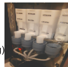
( http://vendingcare.in/vendingcare/Images/JobImages/75217_2.png )