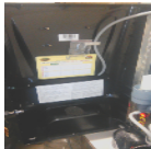
( http://vendingcare.in/vendingcare/Images/JobImages/75217_3.png )