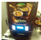
( http://vendingcare.in/vendingcare/Images/JobImages/74844_4.png )