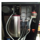
( http://vendingcare.in/vendingcare/Images/JobImages/74844_1.png )