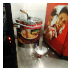
( http://vendingcare.in/vendingcare/Images/JobImages/74844_3.png )