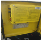
( http://vendingcare.in/vendingcare/Images/JobImages/82399_3.png )