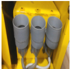
( http://vendingcare.in/vendingcare/Images/JobImages/82399_1.png )