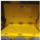
( http://vendingcare.in/vendingcare/Images/JobImages/82399_4.png )