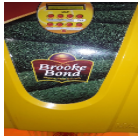
( http://vendingcare.in/vendingcare/Images/JobImages/77476_3.png )