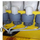
( http://vendingcare.in/vendingcare/Images/JobImages/77476_2.png )