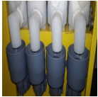
( http://vendingcare.in/vendingcare/Images/JobImages/77476_1.png )