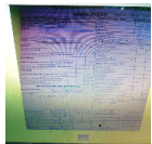
( http://vendingcare.in/vendingcare/Images/JobImages/83092_4.png )