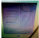
( http://vendingcare.in/vendingcare/Images/JobImages/83092_1.png )