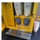
( http://vendingcare.in/vendingcare/Images/JobImages/81853_1.png )