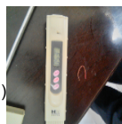
( http://vendingcare.in/vendingcare/Images/JobImages/81853_5.png )