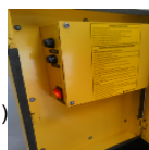
( http://vendingcare.in/vendingcare/Images/JobImages/81853_2.png )